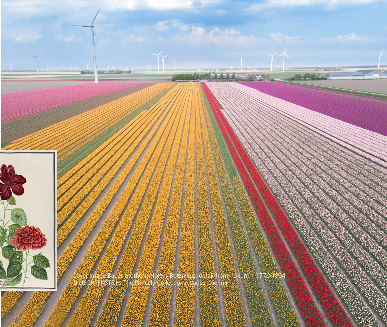
Cover image Bauer brothers, Hortus Botanicus, detail from "Lilium," 1776/1804